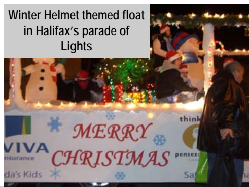
Winter Helmet themed float in Halifax's parade of Lights