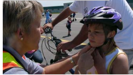
A volunteer fits a helmet during Kingston's bike rodeo

cently formed an Advisory Board. Affiliated with the Island Network for Injury Prevention, the Chapter continues to focus on kindergarten bike