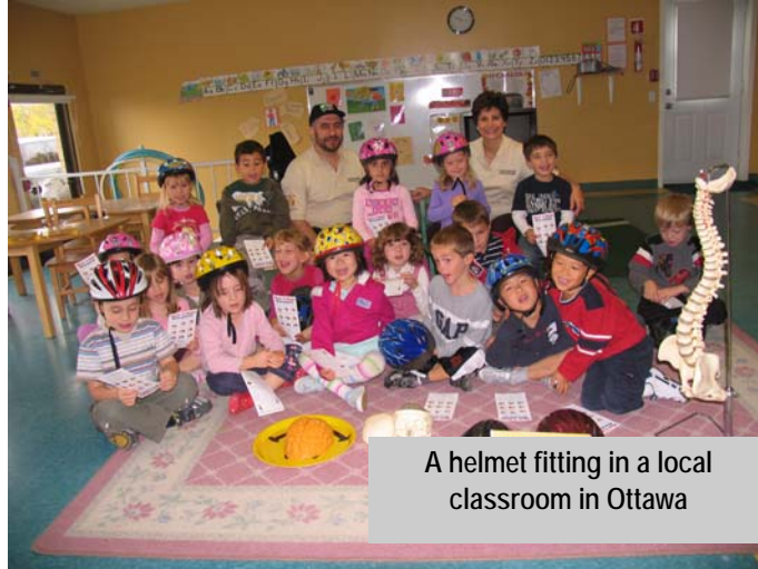
A helmet fitting in a local classroom in Ottawa

might. During this time we've opened three new sites – two in the province of Quebec