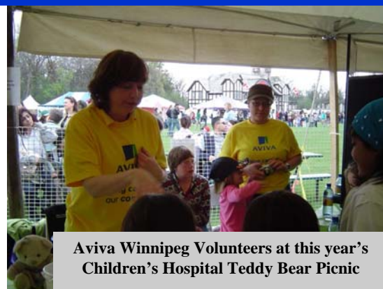
Aviva Winnipeg Volunteers at this year's Children's Hospital Teddy Bear Picnic

In BC, Calgary, Winnipeg, Toronto, Kingston, Hamilton, Quebec, Nova Scotia, PEI, and New Brunswick we've had the help of Aviva volunteers who've strengthened our Chapters with a palpable enthusiasm matched only by their dedication. Thank you Aviva!